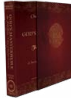
God's Masterwork, Volume Seven: The Final Word—A Survey of Hebrews–Revelation by Charles R. Swindoll CD series

For these and related resources, visit www.insightworld.org/store or call USA 1-800-772-8888 • AUSTRALIA +61 3 9762 6613 • CANADA 1-800-663-7639 • UK +44 1306 640156