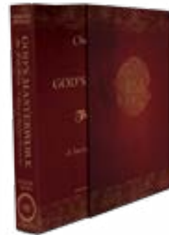
God's Masterwork, Volume Seven: The Final Word—A Survey of Hebrews—Revelation by Charles R. Swindoll CD series

For these and related resources, visit www.insightworld.org/store or call USA 1-800-772-8888 • AUSTRALIA +61 3 9762 6613 • CANADA 1-800-663-7639 • UK +44 1306 640156