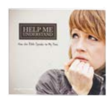
Help Me Understand: How the Bible Speaks to My Pain by Insight for Living Ministries Canada softcover book