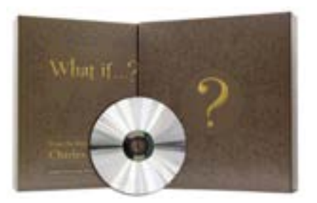
What If . . . ? by Charles R. Swindoll and Insight for Living Ministries Classic CD series