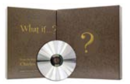
What If . . . ? by Charles R. Swindoll and Insight for Living Ministries Classic CD series