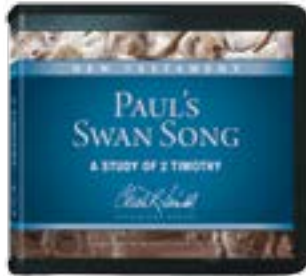
Paul's Swan Song: A Study of 2 Timothy by Charles R. Swindoll and Insight for Living Ministries CD series