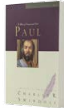
Paul: A Man of Grace and Grit by Charles R. Swindoll softcover book

For these and related resources, visit www.insightworld.org/store or call USA 1-800-772-8888 • AUSTRALIA +61 3 9762 6613 • CANADA 1-800-663-7639 • UK +44 1306 640156