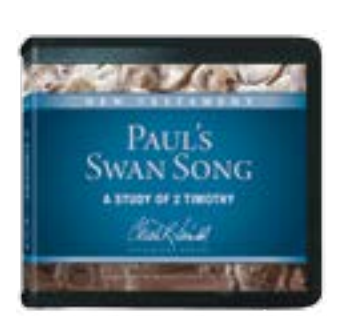
Paul's Swan Song: A Study of 2 Timothy by Charles R. Swindoll and Insight for Living Ministries CD series