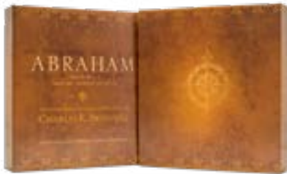
Abraham: One Nomad's Amazing Journey of Faith by Charles R. Swindoll Classic CD series