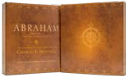
Abraham: One Nomad's Amazing Journey of Faith by Charles R. Swindoll Classic CD series