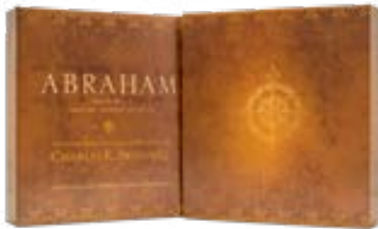
Abraham: One Nomad's Amazing Journey of Faith by Charles R. Swindoll Classic CD series