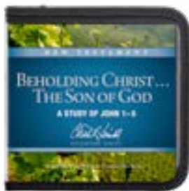
Beholding Christ . . . The Son of God: A Study of John 1–5 by Charles R. Swindoll CD series