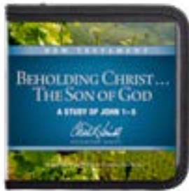
Beholding Christ . . . The Son of God: A Study of John 1–5 by Charles R. Swindoll CD series