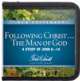
Following Christ . . . The Man of God: A Study of John 6–14 by Charles R. Swindoll CD series