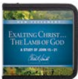
Exalting Christ . . . The Lamb of God: A Study of John 15–21 — A Signature Series by Charles R. Swindoll CD series