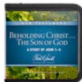
Beholding Christ . . . The Son of God: A Study of John 1–5 — A Signature Series by Charles R. Swindoll CD series

For these and related resources, visit www.insightworld.org/store or call USA 1-800-772-8888 • AUSTRALIA +61 3 9762 6613 • CANADA 1-800-663-7639 • UK +44 1306 640156