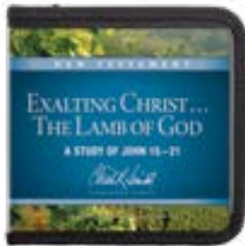
Exalting Christ . . . The Lamb of God: A Study of John 15–21 — A Signature Series by Charles R. Swindoll CD series