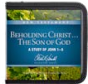
Beholding Christ . . . The Son of God: A Study of John 1–5 — A Signature Series by Charles R. Swindoll CD series

For these and related resources, visit www.insightworld.org/store or call USA 1-800-772-8888 • AUSTRALIA +61 3 9762 6613 • CANADA 1-800-663-7639 • UK +44 1306 640156