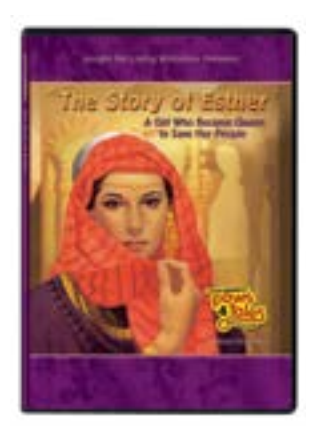
The Story of Esther: A Girl Who Became Queen to Save Her People by Paws & Tales CD set

For these and related resources, visit www.insightworld.org/store or call USA 1-800-772-8888 • AUSTRALIA +61 3 9762 6613 • CANADA 1-800-663-7639 • UK +44 1306 640156