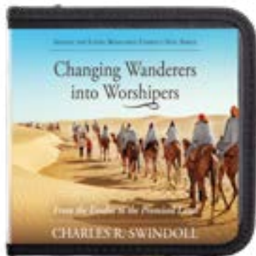
Changing Wanderers into Worshipers: From the Exodus to the Promised Land by Charles R. Swindoll CD series