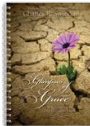
Glimpses of Grace: 30 Reflections on Old Testament Lives by Insight for Living Ministries Softcover book

For these and related resources, visit www.insightworld.org/store or call USA 1-800-772-8888 • AUSTRALIA +61 3 9762 6613 • CANADA 1-800-663-7639 • UK +44 1306 640156