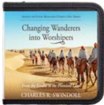
Changing Wanderers into Worshipers: From the Exodus to the Promised Land by Charles R. Swindoll CD series