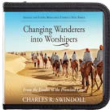
Changing Wanderers into Worshipers: From the Exodus to the Promised Land by Charles R. Swindoll CD series