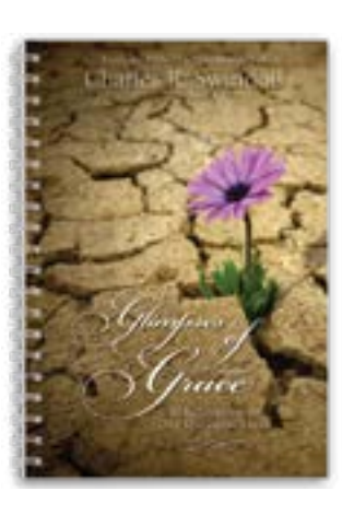
Glimpses of Grace: 30 Reflections on Old Testament Lives by Insight for Living Ministries Softcover book

For these and related resources, visit www.insightworld.org/store or call USA 1-800-772-8888 • AUSTRALIA +61 3 9762 6613 • CANADA 1-800-663-7639 • UK +44 1306 640156