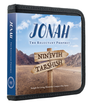
Jonah: The Reluctant Prophet by Charles R. Swindoll CD series