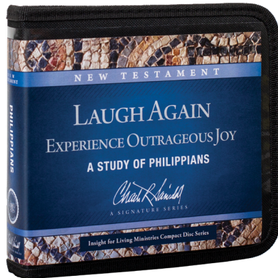
Laugh Again: Experience Outrageous Joy by Charles R. Swindoll CD series