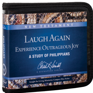
Laugh Again: Experience Outrageous Joy by Charles R. Swindoll CD series