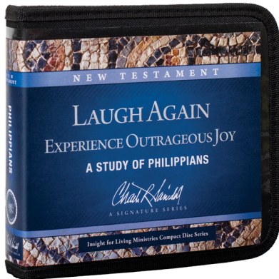
Laugh Again: Experience Outrageous Joy by Charles R. Swindoll CD series