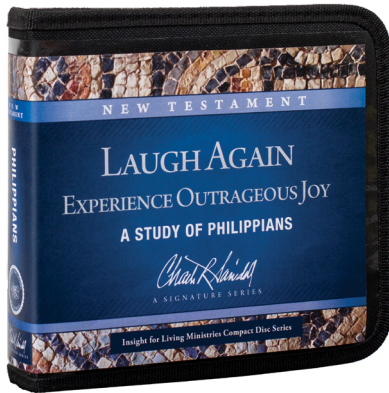
Laugh Again: Experience Outrageous Joy by Charles R. Swindoll CD series