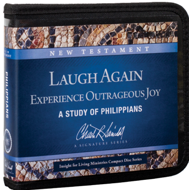
Laugh Again: Experience Outrageous Joy by Charles R. Swindoll CD series