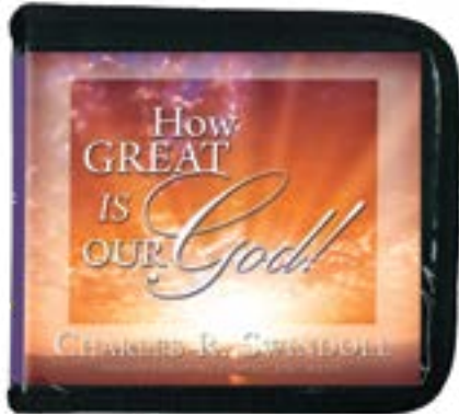
How Great Is Our God by Charles R. Swindoll CD series