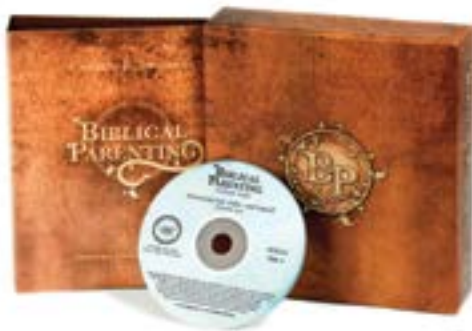
Biblical Parenting by Charles R. Swindoll CD series