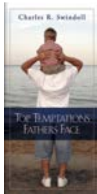
Top Temptations Fathers Face by Charles R. Swindoll booklet