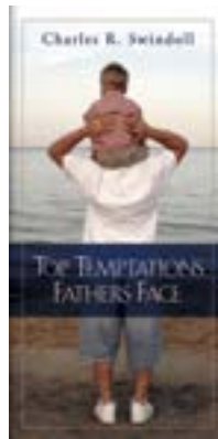
Top Temptations Fathers Face by Charles R. Swindoll booklet