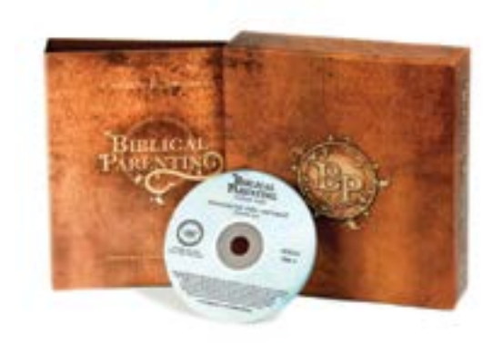
Biblical Parenting by Charles R. Swindoll CD series