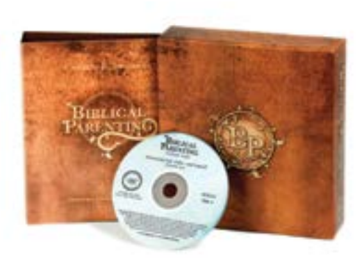
Biblical Parenting by Charles R. Swindoll CD series