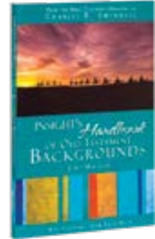
Insight's Handbook of Old Testament Backgrounds: Key Customs from Each Book, Job–Malachi by Insight for Living Ministries softcover book

For these and related resources, visit www.insightworld.org/store or call USA 1-800-772-8888 • AUSTRALIA +61 3 9762 6613 • CANADA 1-800-663-7639 • UK +44 1306 640156