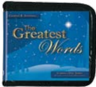
The Greatest Words by Charles R. Swindoll CD series