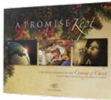
A Promise Kept: A Pictorial Journey of the Coming of Christ by Insight for Living Ministries softcover book