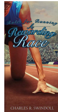
Rules for Running a Rewarding Race by Charles R. Swindoll booklet

For these and related resources, visit insightworld.org/store or call USA 1-800-772-8888 • AUSTRALIA +61 3 9762 6613 • CANADA 1-800-663-7639 • UK +44 1306 640156