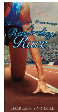
Rules for Running a Rewarding Race by Charles R. Swindoll booklet

For these and related resources, visit insightworld.org/store or call USA 1-800-772-8888 • AUSTRALIA +61 3 9762 6613 • CANADA 1-800-663-7639 • UK +44 1306 640156